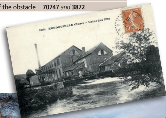
The Plis factory around 1910.