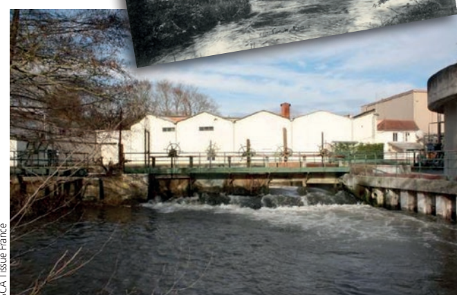
The Plis weir in 2014.