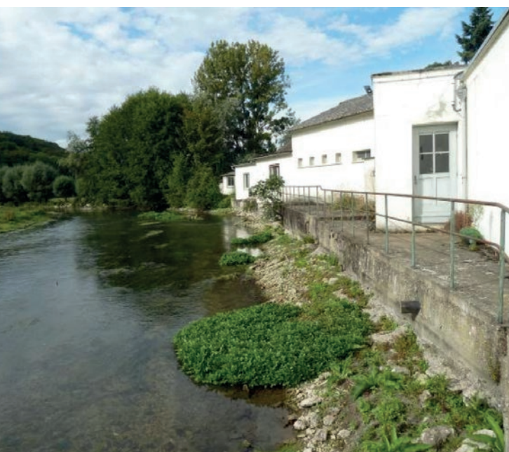
SCA Tissue France

Saviton, Seine-Normandie water agency, Eure departmental territorial and maritime agency, Onema, Haute-Normandie regional environmental directorate, Egis Eau consulting firm, SETHY company