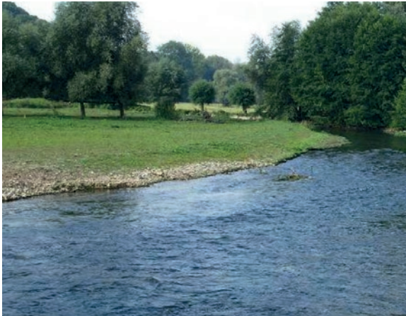
The meadow after restoration of the wetland (2014).